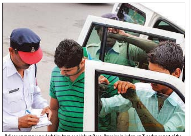
Policemen removing a dark film from a vehicle at Regal Crossing in Indore on Tuesday as part of the